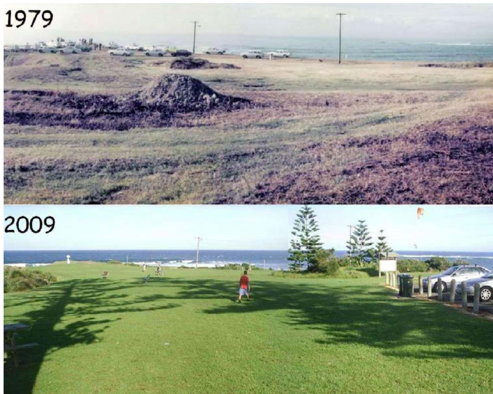
Figure 1 Note the heavy tracks from dump trucks and dumped material

Local citizens and fellow surfers became volunteer Council Rangers to ensure the Park maintained its appeal. All major community groups in Northern Illawarra have given written support for the recognition of Paul Mason Jones Reserve.