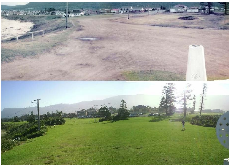
Figure 2. Note the unchanged power poles and trig station in all photos.